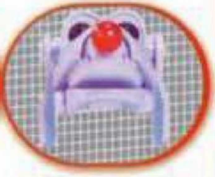
Know It All